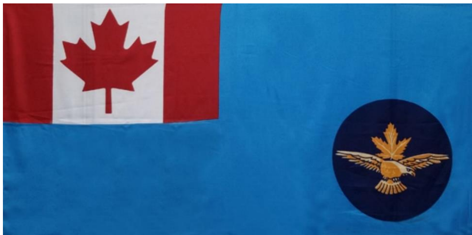
Figure 1: Air Cadet Ensign

In accordance with official policy, there is only one design of Air Cadet Ensign for all squadrons of the Royal Canadian Air Cadets. The design, approved by Her Majesty Queen Elizabeth II in 1971, consists of the Canadian Flag on a field of Air Force blue with an eagle surmounted by a maple leaf, in gold, in a circle of royal blue. The Air Cadet Ensign is senior to the Air Cadet Squadron Banner. Ensigns are available through the National Headquarters of the Air Cadet League of Canada.