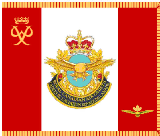
Figure 4: Royal Canadian Air Cadets Banner

The Royal Canadian Air Cadets' Banner was approved by the Governor General of Canada in October 1990. It is based on the Canadian Flag with a bilingual badge of the Royal Canadian Air Cadets in the centre. Prince Philip's cipher is in the top hoist and the device from the Royal Canadian Air Cadet Ensign is in the bottom fly.