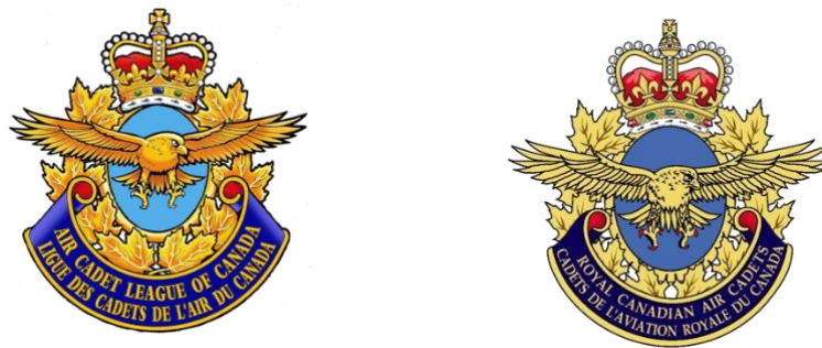
Figure 5: Official Badges

Official badges for the Air Cadets and the Air Cadet League of Canada have been approved for use by Squadrons and Committees on official documents, letterheads, etc. The design comprises a falcon in flight against the background of a wreath of maple leaves supporting the crown. Across the base are ribbons bearing the words “Royal Canadian Air Cadets - Cadets de l’aviation Royale du Canada” and “The Air Cadet League of Canada - La Ligue des cadets de l’Air du Canada”. The badges are illustrated below.