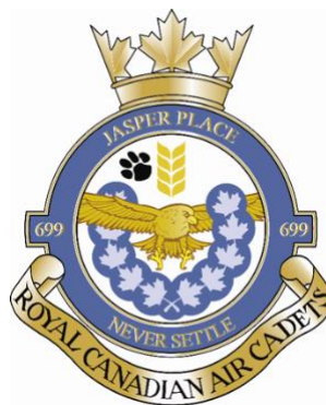
Figure 6: Example Squadron Badge

To provide an official basis for individual Squadron badges, the Air Cadet League of Canada has adopted a basic design for such a badge and established a procedure under which the required official approval may be granted. A sample badge is illustrated below.