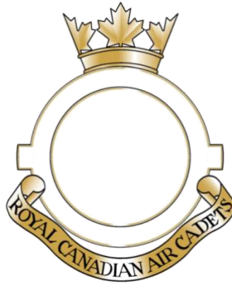
Figure 7: Squadron Badge Template