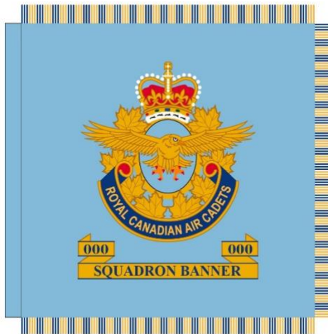
Figure 2: Air Cadet Squadron Banner

The Air Cadet Squadron Banner was approved for issue to Air Cadet Squadrons by the Air Cadet League of Canada in 1963. The official design of the Banner consists of a field of Air Force blue on both sides of which is embroidered the official badge of the Royal Canadian Air Cadets. Beneath the badge is an embroidered scroll incorporating the name and number of the individual squadron. The Air Cadet Squadron Banner is junior to the Air Cadet Ensign and is displayed and carried only by members of the Squadron to which it is presented. Embroidered banners are obtainable through the National Headquarters of the Air Cadet League of Canada. To save costs, squadrons are authorized to obtain and use a non-embroidered banner. A special directive outlining the Presentation Ceremonies and Drill Movements for the presentation of Air Cadet Ensigns and Banners is available from Air Cadet League Headquarters.