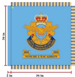
Air Cadets Squadron Banner - (F)