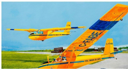
'Mountain View Morning'. High quality print depicting our 233 Glider, paper size

Visit: https://aircadetleague.com/store/