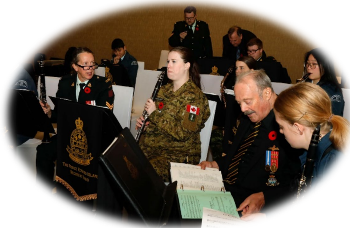
Cadets playing with the PEI R Band.