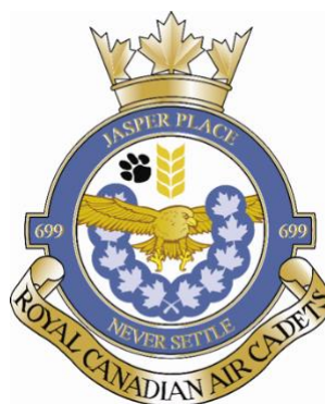
Figure 6: Example Squadron Badge

To provide an official basis for individual Squadron badges, the Air Cadet League of Canada has adopted a basic design for such a badge and established a procedure under which the required official approval may be granted. A sample badge is illustrated below.