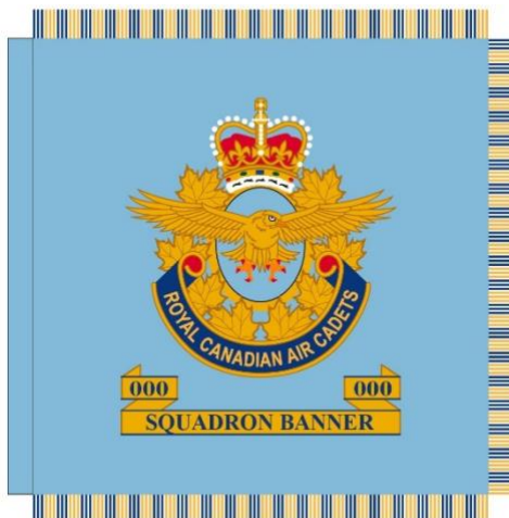
Figure 2: Air Cadet Squadron Banner

The Air Cadet Squadron Banner was approved for issue to Air Cadet Squadrons by the Air Cadet League of Canada in 1963. The official design of the Banner consists of a field of Air Force blue on both sides of which is embroidered the official badge of the Royal Canadian Air Cadets. Beneath the badge is an embroidered scroll incorporating the name and number of the individual squadron. The Air Cadet Squadron Banner is junior to the Air Cadet Ensign and is displayed and carried only by members of the Squadron to which it is presented. Embroidered banners are obtainable through the National Headquarters of the Air Cadet League of Canada. To save costs, squadrons are authorized to obtain and use a non-embroidered banner. A special directive outlining the Presentation Ceremonies and Drill Movements for the presentation of Air Cadet Ensigns and Banners is available from Air Cadet League Headquarters.