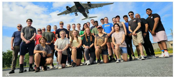
Activities / visits happened in Montreal, Quebec and Ottawa