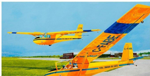
'Mountain View Morning'. High quality print depicting our 233 Glider, paper size 24"x 33"

Visit: https://aircadetleague.com/store/