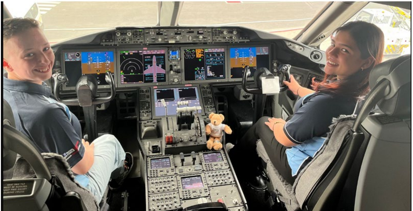
"Just landed in Canada, eager for the excitement the next 2 weeks would bring. Very grateful to the Air Canada Crew for taking the time to explain and allow us to explore the cockpit of the aircraft we flew there in!"