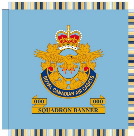
Figure 2: Air Cadet Squadron Banner

The Air Cadet Squadron Banner was approved for issue to Air Cadet Squadrons by the Air Cadet League of Canada in 1963. The official design of the Banner consists of a field of Air Force blue on both sides of which is embroidered the official badge of the Royal Canadian Air Cadets. Beneath the badge is an embroidered scroll incorporating the name and number of the individual squadron. The Air Cadet Squadron Banner is junior to the Air Cadet Ensign and is displayed and carried only by members of the Squadron to which it is presented. Embroidered banners are obtainable through the National Headquarters of the Air Cadet League of Canada. To save costs, squadrons are authorized to obtain and use a non-embroidered banner. A special directive outlining the Presentation Ceremonies and Drill Movements for the presentation of Air Cadet Ensigns and Banners is available from Air Cadet League Headquarters.