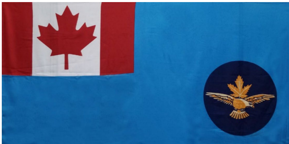
Figure 1: Air Cadet Ensign

In accordance with official policy, there is only one design of Air Cadet Ensign for all squadrons of the Royal Canadian Air Cadets. The design, approved by Her Majesty Queen Elizabeth II in 1971, consists of the Canadian Flag on a field of Air Force blue with an eagle surmounted by a maple leaf, in gold, in a circle of royal blue. The Air Cadet Ensign is senior to the Air Cadet Squadron Banner. Ensigns are available through the National Headquarters of the Air Cadet League of Canada.