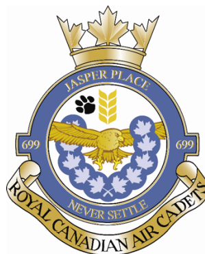
Figure 6: Example Squadron Badge

To provide an official basis for individual Squadron badges, the Air Cadet League of Canada has adopted a basic design for such a badge and established a procedure under which the required official approval may be granted. A sample badge is illustrated below.