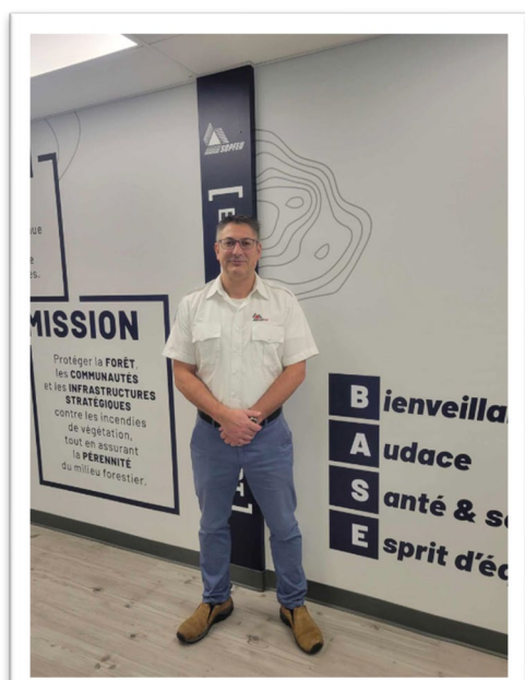
SOPFEU, Picture taken at CPL

I'm grateful to have learned different skills and competencies in the cadet program, which have greatly contributed to my achieving a high level of professionalism and enabling me to serve the community well, to continue to progress and to help others progress by transferring my knowledge to them.