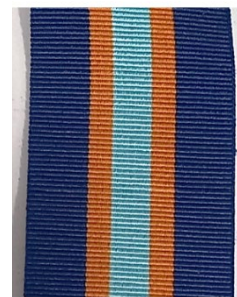
Air Cadet League of Canada Cadet Service Medal

The new medals are currently in production. Actual medal will be supplied until stock is exhausted.