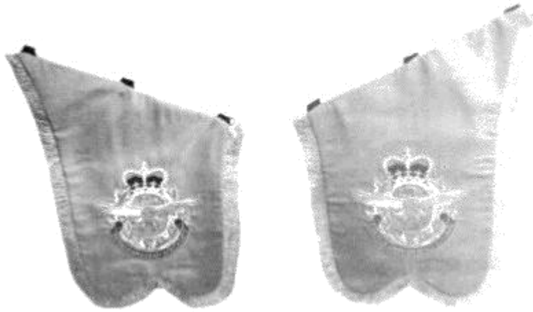
Figure 3: Royal Canadian Air Cadets Pipe Banner