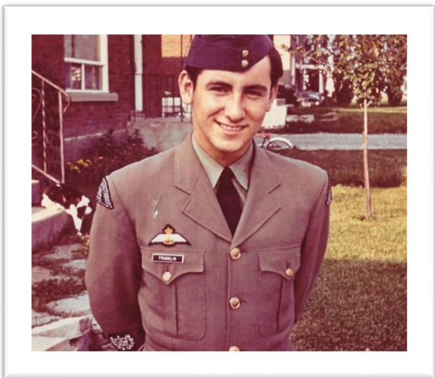
Course Completed 1969