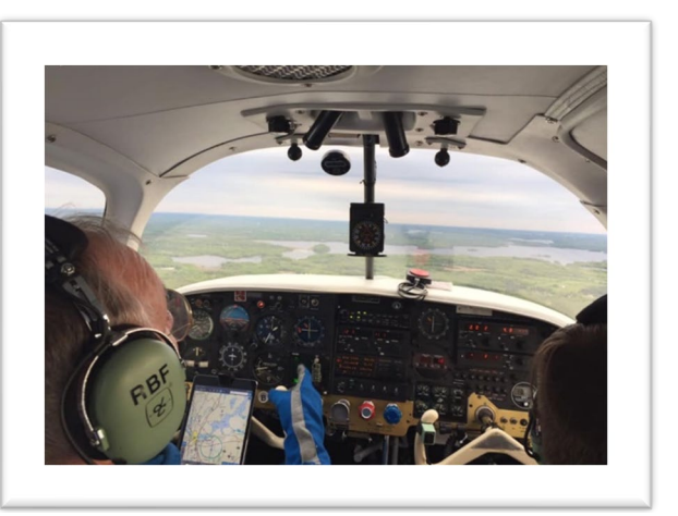
Famil Flying over the Smiths Falls Area June 2019