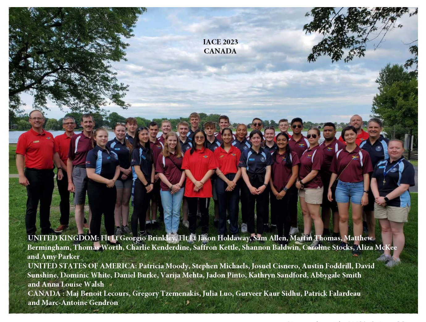
Plcture taken at the RMC in St-Jean, QC