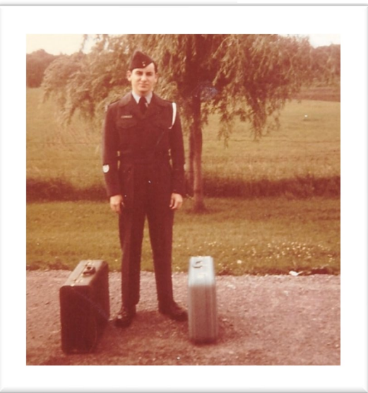
Bags are packed...off to Flight School