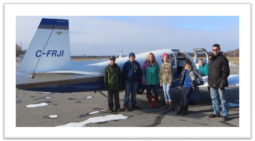
Famil Flying Cadets at Cornwall Regional Airport