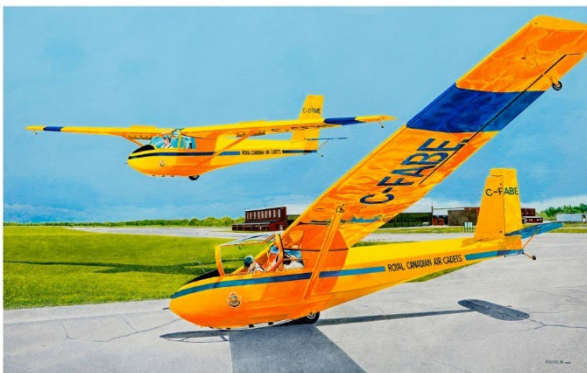
'Mountain View Morning'. High quality print depicting our 233 Glider, paper size 24"x 33"