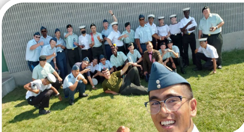
2022 Connaught CTC ARMIC Serial 2 Platoon 3)