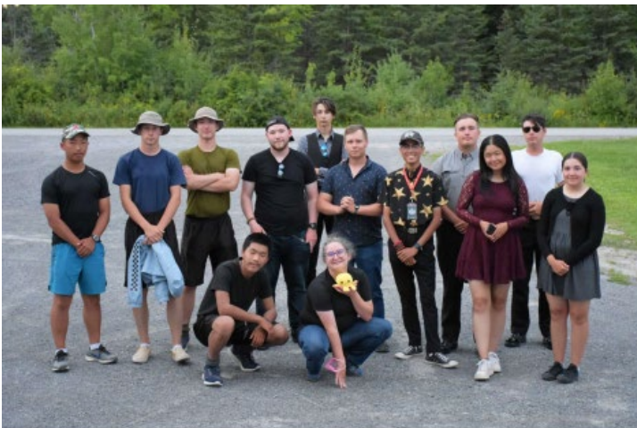
Connaught CTC ARMIC Staff (Not all are shown)