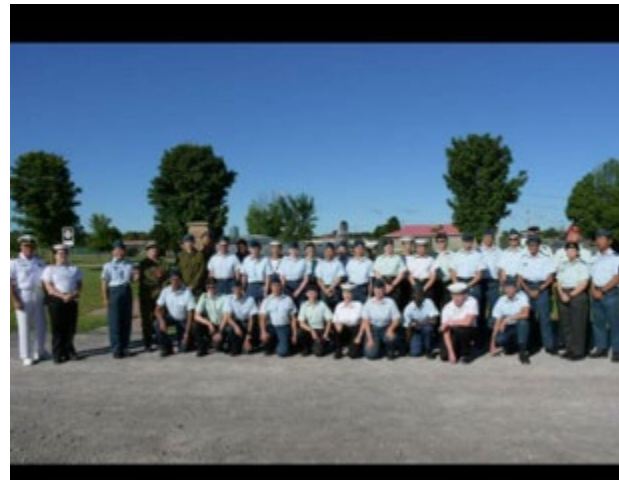
1022 Connaught CTC ARMIC Serial 1 Platoon 2