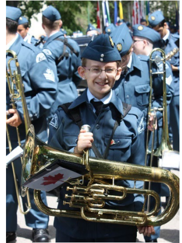
Freedom of the City Parade in Winnipeg (2016)

Every year I participated in Legion Parades for Remembrance Day. Sometimes our boots would sink in the snow, and we would freeze our hands to the bone, but I was still proud to serve! Participating in Summer Band Camps as staff cadet and course cadet encouraged me to grow as a musician and as a leader and establish new friendships. Taking part in the Royal Nova Scotia International Tattoo gave me the chance to assist in a world-