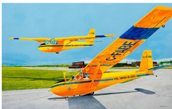
'Mountain View Morning'. High quality print depicting our 233 Glider, paper size 24"x 33"