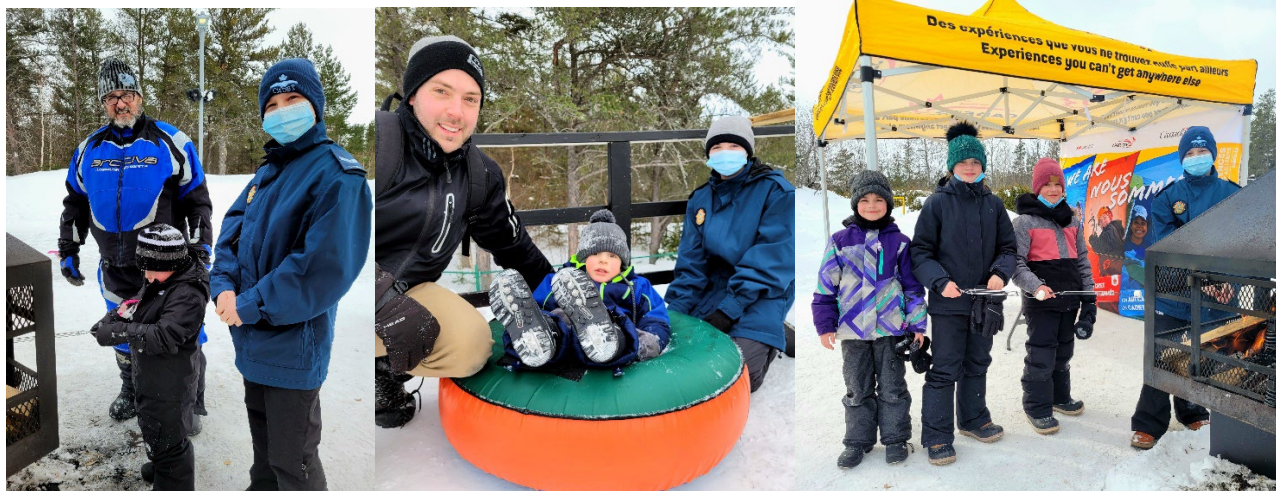
Photo and text credit: Captain Anabelle Dallaire, Unit Public Affairs Representative